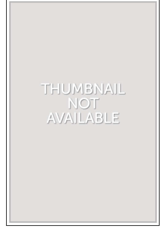
Filesize: 5.15 MB