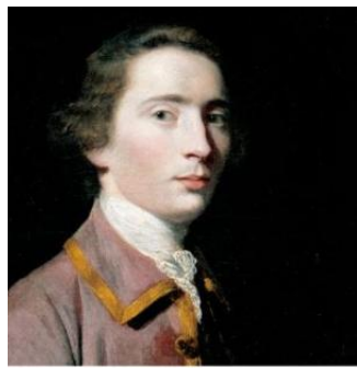
Clara Reeve The Old English Baron