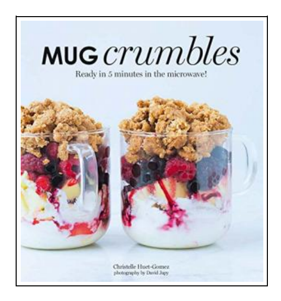
Filesize: 3.81 MB