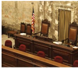
ED466 025 - U.S. Department of Education Strategic Plan, 2002-2007