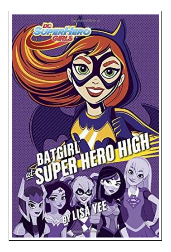
Filesize: 3.71 MB