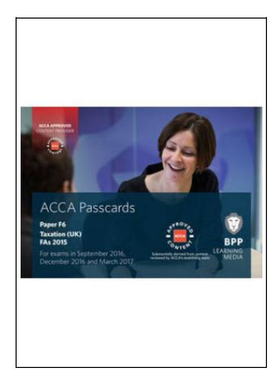
Filesize: 3.49 MB