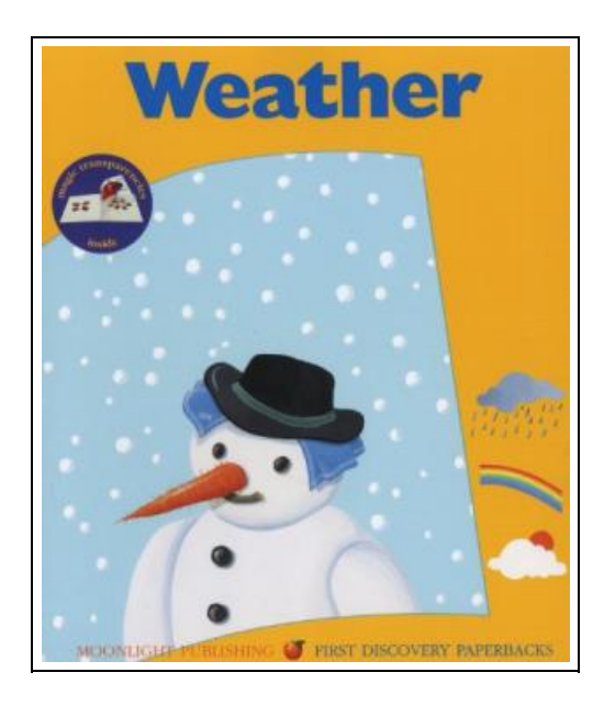
Filesize: 6.12 MB