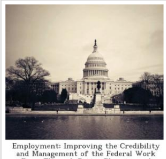
d Management of the Federal Wo Force Through Better Planning and Budgetary Controls: FPCD-81-54

U.S. Government Accountability Office (GAO)