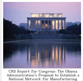
CRS Report for Congress: The Obama Administration's Proposal to Establish a National Network for Manufacturing Innovation