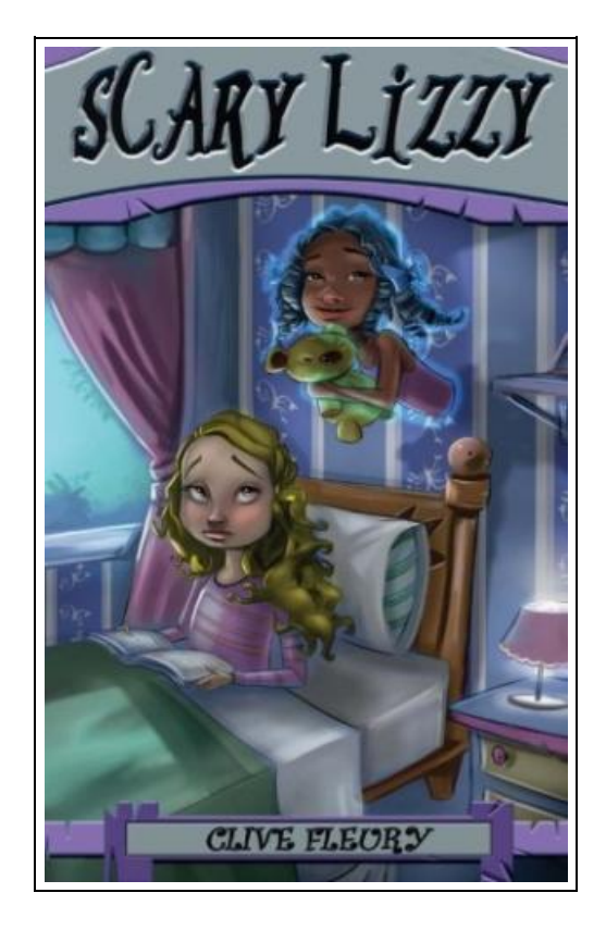
Filesize: 6.43 MB