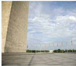
Earthquakes: USGS General Information Product