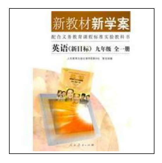
Filesize: 9.11 MB