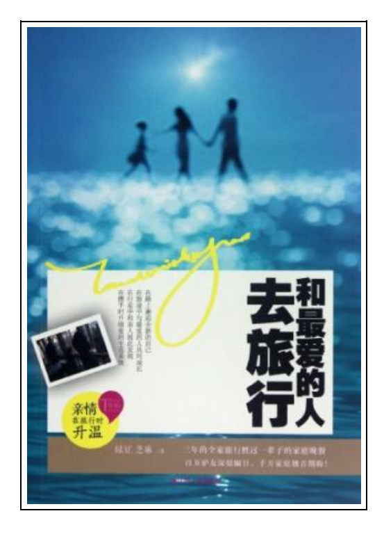
Filesize: 5.21 MB