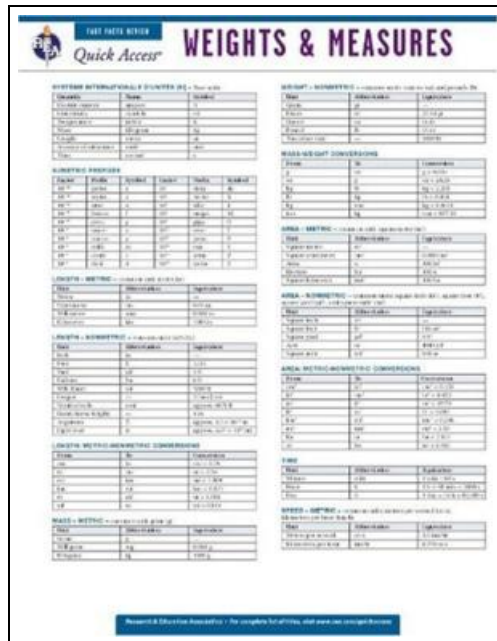
Filesize: 3.54 MB