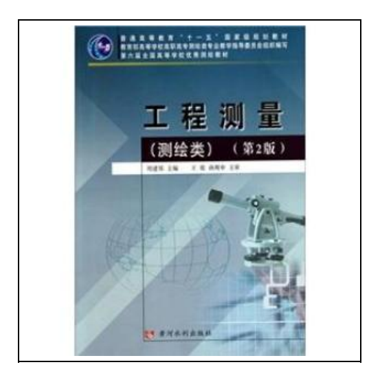
Filesize: 4.87 MB