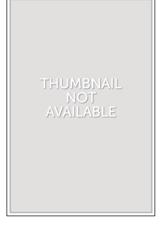
Filesize: 6.51 MB