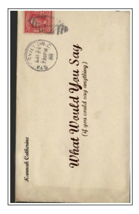
Filesize: 3.48 MB