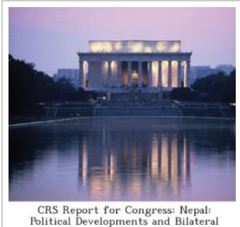
CRS Report for Congress: Nepal: Political Developments and Bilateral Relations with the United States: October 23, 2008 - RL34731

Congressional Research Service: The Library of Congress, Bruce Vaughn