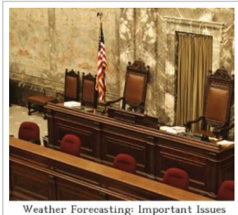
Weather Forecasting: Important Issues on Automated Weather Processing System Need Resolution: IMTEC-93-12BR

U.S. Government Accountability Office (GAO)