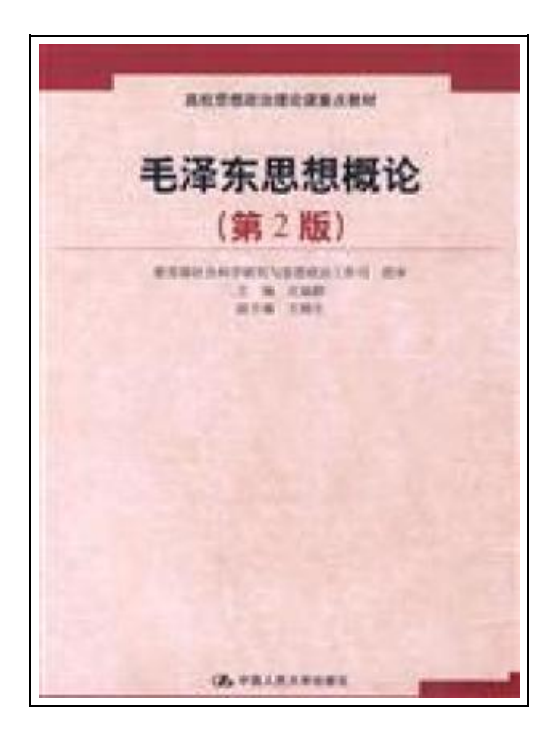
Filesize: 3.57 MB