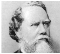
UNION & COMMUNION THOUGHTS ON THE SONG OF SOLOMON HUDSON TAYLOR