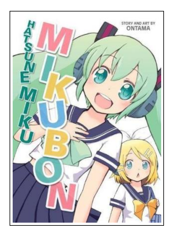
Filesize: 8.22 MB