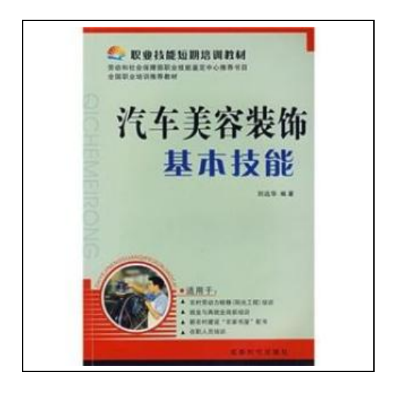
Filesize: 6.5 MB