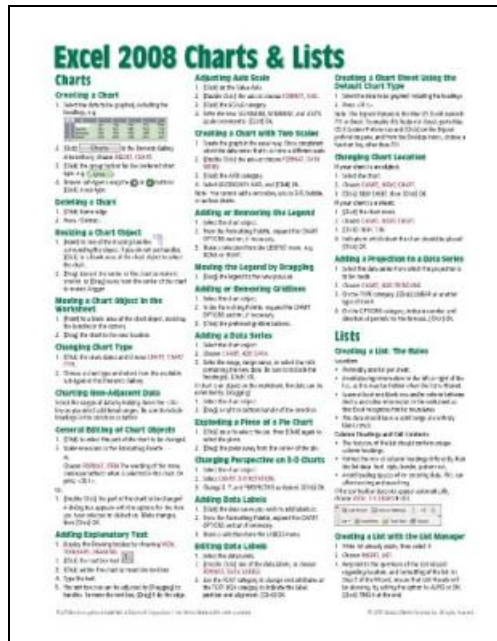
Filesize: 6.72 MB