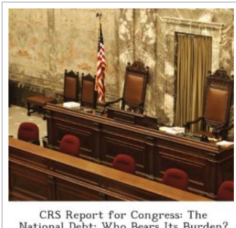
CRS Report for Congress: The National Debt: Who Bears Its Burden? February 28, 2008 - RL30520

Congressional Research Service: The Library of Congress