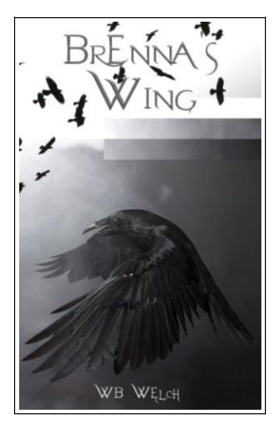
Filesize: 6.43 MB