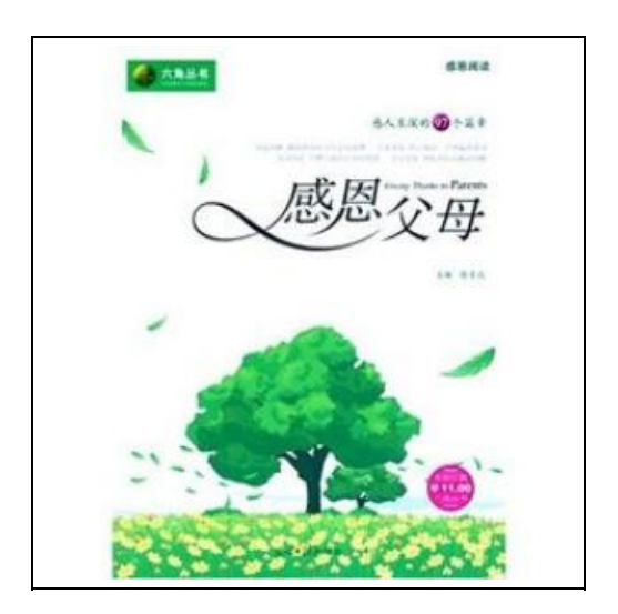
Filesize: 8.83 MB