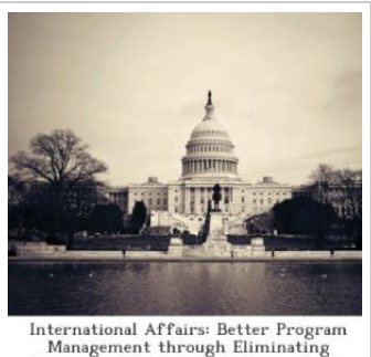
International Affairs: Better Program Management through Eliminating Exchange Rate Gains and Losses from DOD Budget Processes: ID-78-33

U.S. Government Accountability Office (GAO)