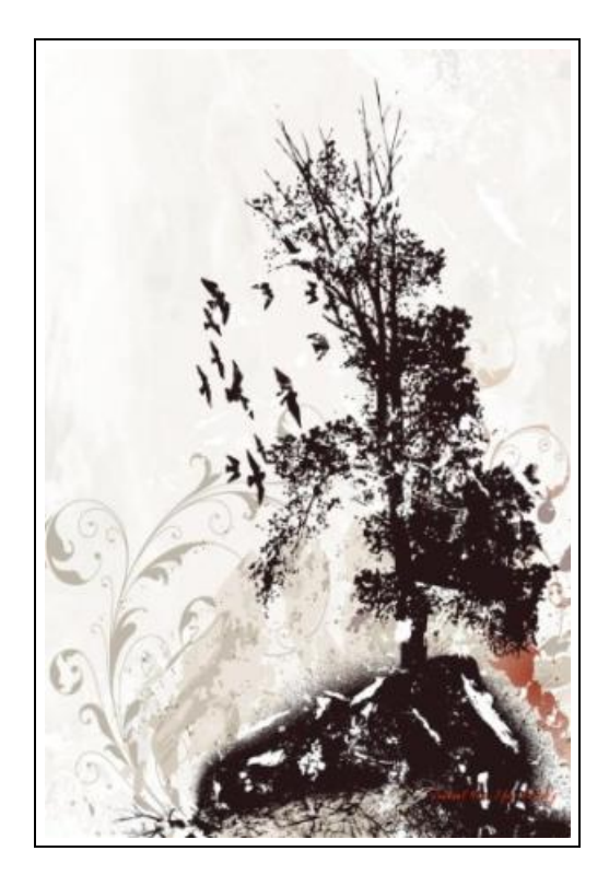
Filesize: 2.7 MB