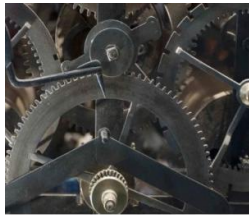
RECOVERY OF GOVERNMENT WASTE PAPER