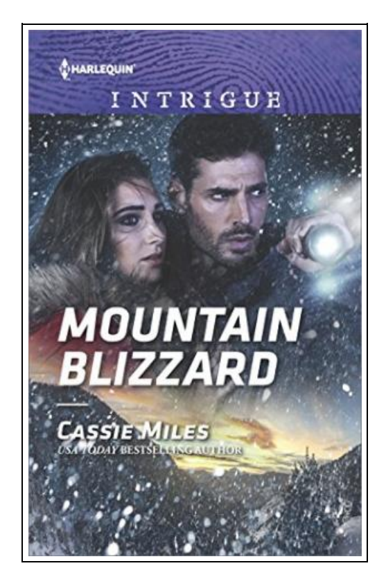
Filesize: 8.02 MB