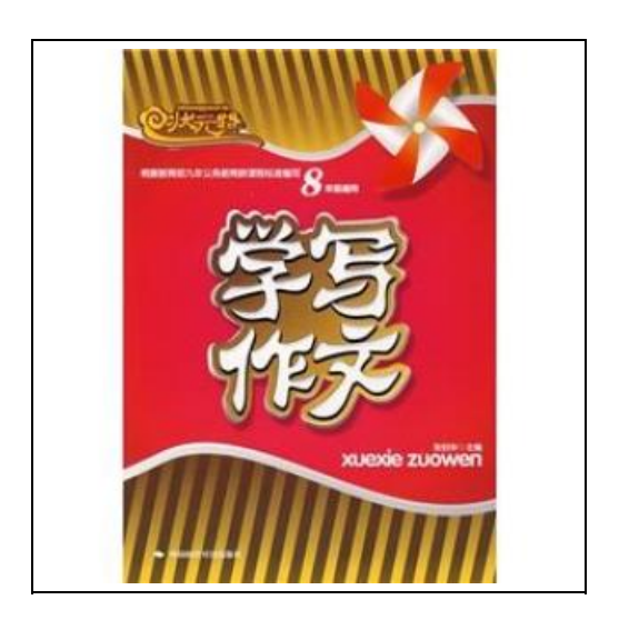
Filesize: 7.79 MB